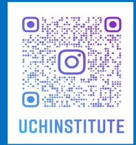
Scan for Instagram