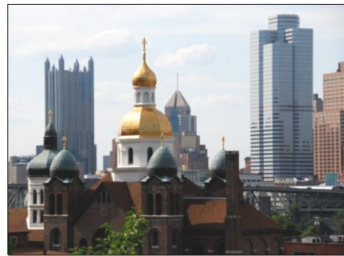
© Ukrainian Cultural and Humanitarian Institute (UCHI) April 2020 [prev. July 2007]

Updated and in full color! We first published “Tour” in 2007 to provide a historical and cultural context to Ukrainian settlement in the City of Pittsburgh and surrounding suburbs. Four different tours provide sites to see, directions, and background information. Some can be walked, others must be taken in an automobile. The booklet contains a historical sketch of Ukrainian settlement in and around Pittsburgh, plus listings of Ukrainian churches and Ukrainian community organizations.